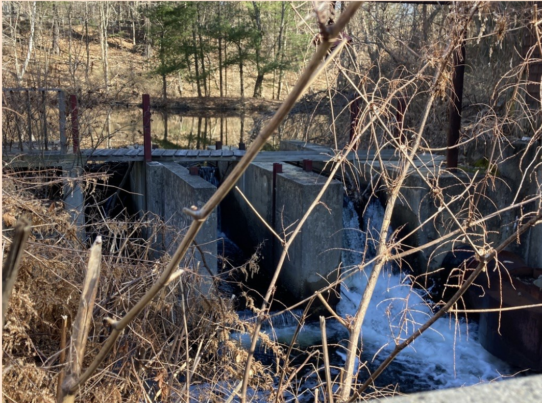
Dam and sluiceway in their current state with 1980 rebuilt concrete dam. 2022